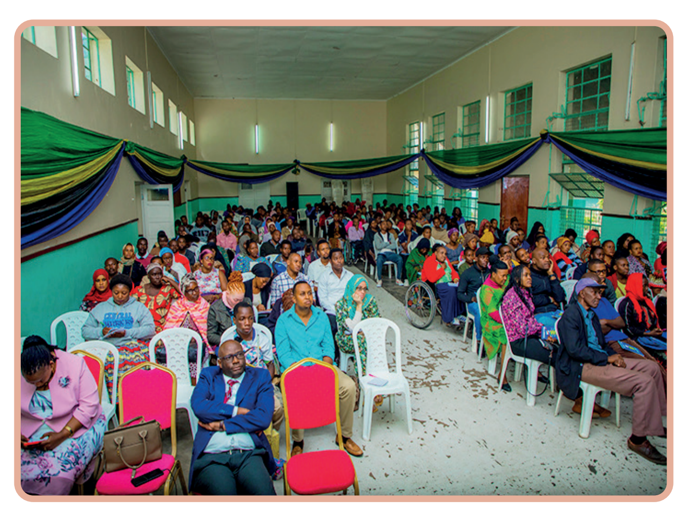
Participants from special groups attend training on procurement opportunities in Arusha, on May 7, 2022

The Editorial Board reserves the right to approve or dissapprove articles for publication in TPJ.