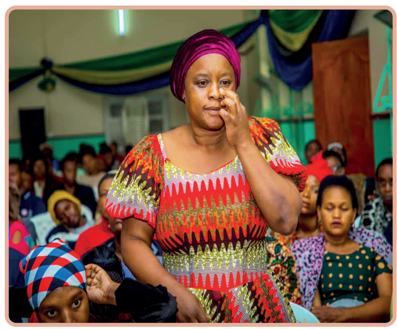
A woman having impaired hearing contributes during the training to special group in Arusha